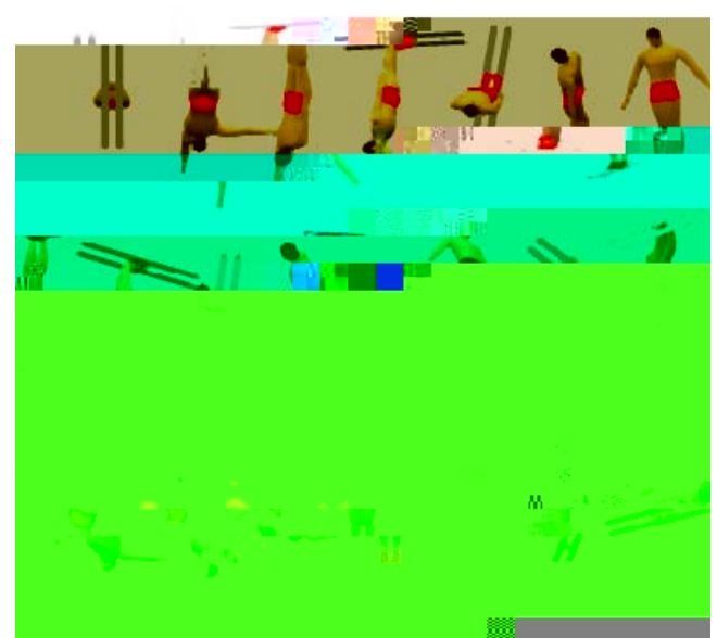
Figure 2: A "full – double full – full" produced using the arm sequence depicted in Figure 1.

Figure 1: Left arm lowered to the side followed by right arm lowered to the front.