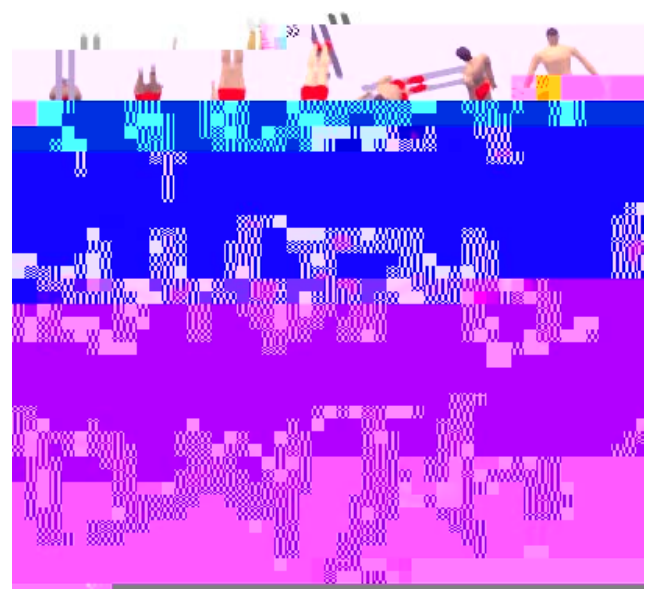
Figure 6: A "full – double full – full" lead up skill using the same arm sequence as in Figure 5.

A lead up skill for this third simulation was produced using the same sequence of arm movements to initiate the tilt and twist but using a more abducted arm position in the second somersault so as to obtain two twists rather than three. This resulted in a "full – double full – full" with wide arms (Figure 6). The advantage of practising such a lead up skill before attempting the five twists is that it allows a gradual approach in the learning process in which shortcomings can be adjusted by changing the arm position. The amount that the arms can be abducted whilst twisting also gives a measure of the twist potential.